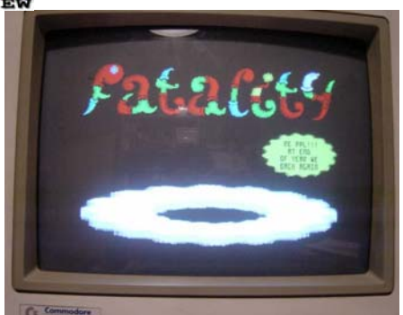
Fatality intro from Quadrax game

The ZX Spectrum menus are of course different from the real Speccy ones. The most noteworthy is the "Hardware" menu that gives you access to the hardware selection list. Here you can choose what Spectrum model/clone is 'emulated' - you can choose from Sprinter ZX, ZX Spectrum, Pentagon 128, Scorpion 256 and Pentagon 512. The machines are almost perfectly emulated (note i say almost because Peters says that it is 99% compatible! for what I tried it all worked well and I found a 100% program compatability). Another intersting menu is the options menu: here you can swich the Turbo On and Off. It's worth noting that although the Sprinter runs at 21MHz, owing to slower memory speed, the Sprinter